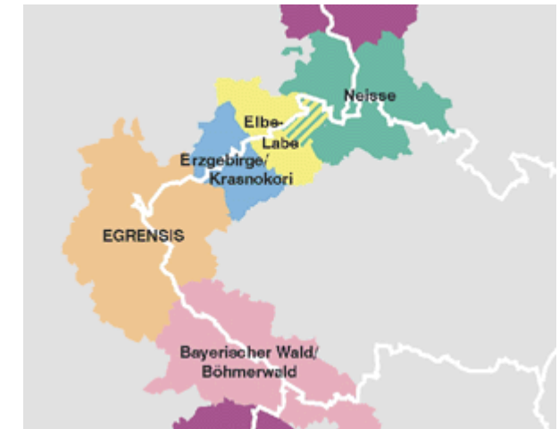
Euroregions on Czech-German border

LUPS-CESCI Research Group on Cross-Border Cooperation