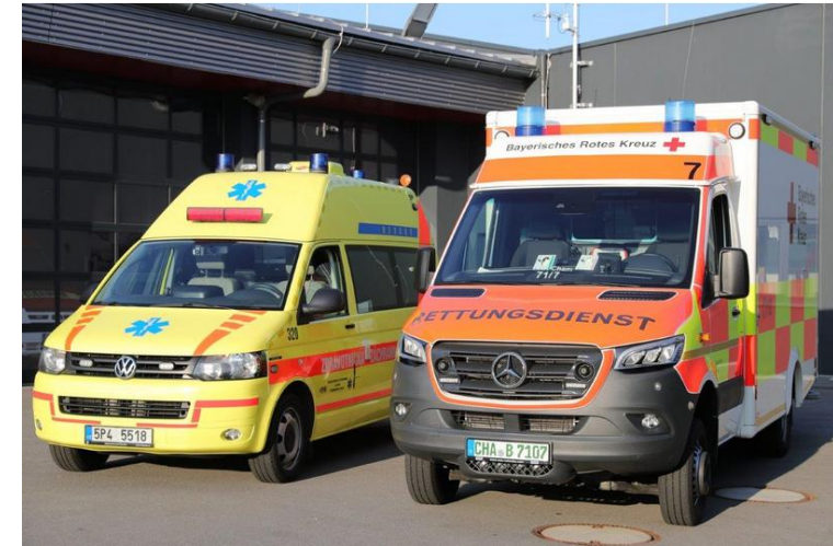
CBC between Pilsen Region and Land District of Cham