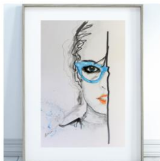
ALLAR VÖRUR Vatnslituð mynd A3 (4) 3,500 kr.