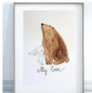
ALLAR VÖRUR Vatnslituð mynd A3 (3) 3,500 kr.