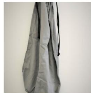
ALLAR VÖRUR Margnota poki – minni gerð 4,990 kr.