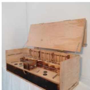
ALLAR VÖRUR Fluguhnýtingataska 59,000 kr.